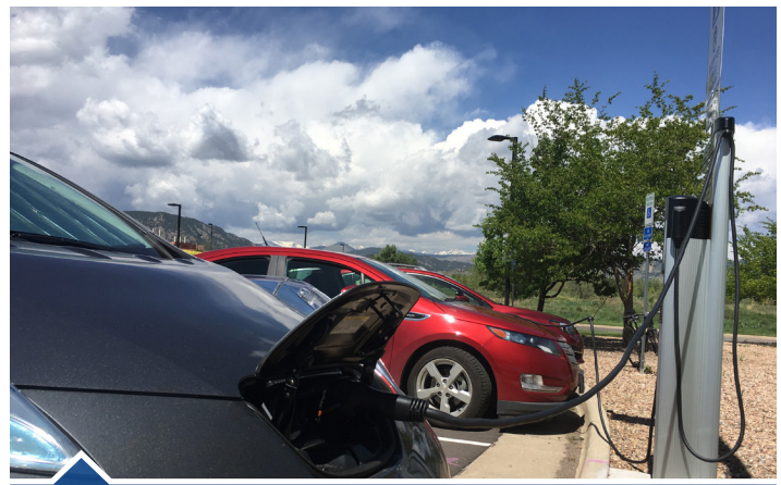
More fast charging stations are needed to encourage widespread adoption of electric vehicles.

Promote other clean modes of transportation like EV carsharing, electric buses and walking, biking and transit in order to encourage clean travel without requiring EV ownership.